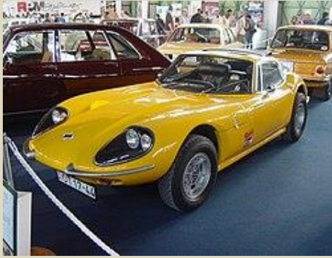
Marcos 1800 GT

In 1964 , the Marcos 1800 GT was introduced, using the four-cylinder Volvo B18 engine with overdrive gearbox and De Dion rear axle. This was to be the design that would become familiar to sports car enthusiasts for more than 30 years, even though the original plywood chassis was replaced in 1969 by a steel chassis, which shortened production time and saved on cost. A