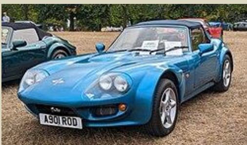
Marcos Mantara Spyder

associated trunnions. This change resulted in a wider front track, different bonnet and flared front arches. The rear wheel arches and rear lights were also changed to give the car a more modern appearance. Power steering was also available for the first time.