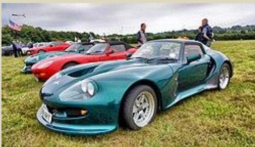
Marcos Mantara LM50

In 1991 , the Marcos Martina, externally similar to the Mantula, was launched but with flared front-wheel arches. It used the Ford Cortina's 2-litre four-cylinder engine, steering and suspension; about 80 were produced. Available as kits or factory-built, the cars were all factory-built from 1992. Production of the Mantula and Martina ceased in 1993.