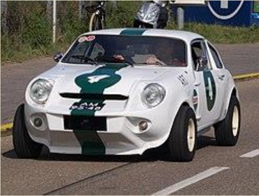
1967 Mini Marcos MkIII

Mini Marcos cars were raced widely, especially as a budget endurance race car. Mini Marcos was also the chosen car for the "First Ladies International Race Team" (FLIRT).