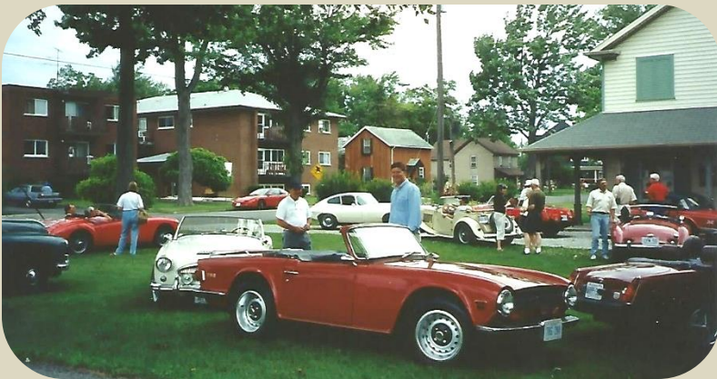
Welland Canal Run – July 2003