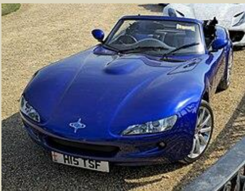
2004 Marcos TS500

This was followed in 2003 by the 5-litre Rover V8-powered TS500.