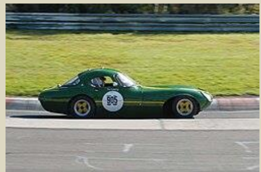
Marcos Luton Gullwing

and low weights (the GT was internationally homologated with 475 kg), so they performed well in competition.