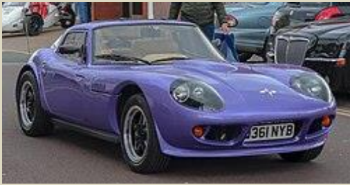
1989 Marcos Mantula

Crossflow, 2.0 Pinto and 2.0 V4s, plus Triumph's 2.0 and 2.5 straight sixes. About 130 kits were sold up to 1989. Competition options include FIA-approved roll-over bar, limited-slip differential, rose-jointed suspension and full harnesses.